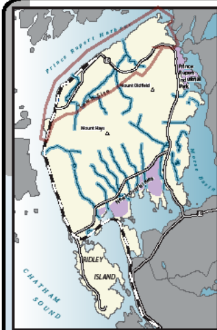
Kaien Island Inset Map